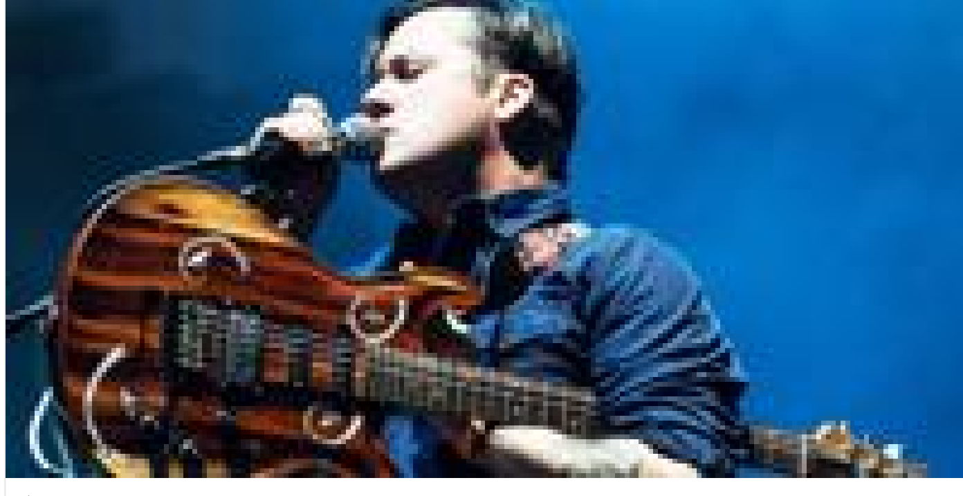
5 things to know about Modest Mouse

Even though Robert's has been in Atlantic City since 2012 — with the exception of the closing period as the Taj transformed into the Hard Rock — Savarese says educating people about aged meat is still a challenge sometimes.